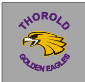
Logo upper left chest