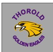
Logo upper left chest